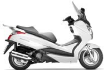
Pearl Cool White