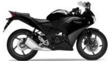
Asteroid Black Metallic