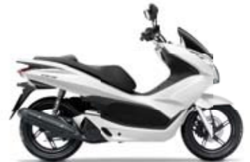
Pearl Himalaya White