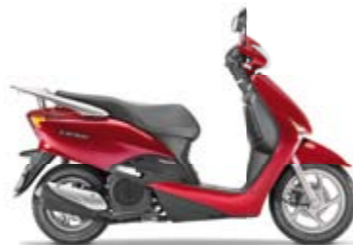
Candy Lucid Red