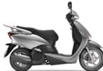
Cosmic Silver Metallic