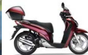
Velvet Red Metallic