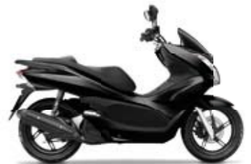
Asteroid Black Metallic