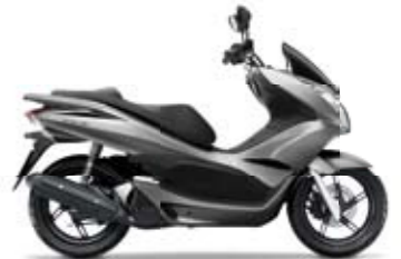
Seal Silver Metallic