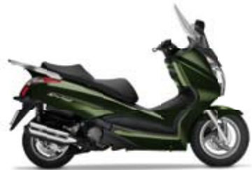
Pearl Harvest Green