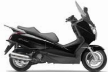
Pearl Nightstar Black