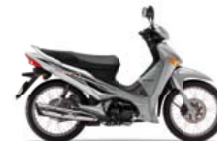
Force Silver Metallic / Terra Silver Metallic