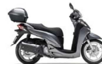
Moondust Silver Metallic