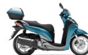
Satin Blue Metallic