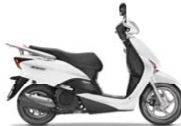
Pearl Silky White