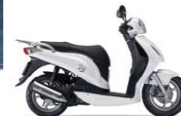
Pearl Cool White