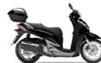
Pearl Nightstar Black