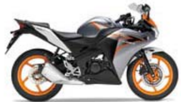
Terra Silver Metallic