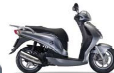
Quasar Silver Metallic