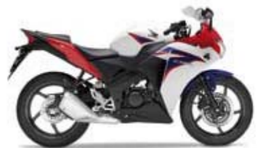
Ross White (Tricolour)