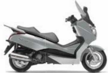
Quasar Silver Metallic