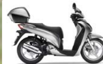
Quasar Silver Metallic