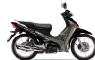
Asteroid Black Metallic / Titanium Metallic