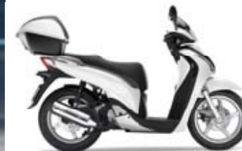
Pearl Cool White