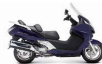
Delta Blue Metallic