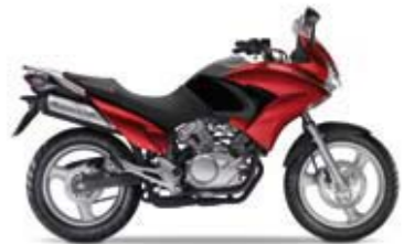
Pearl Siena Red