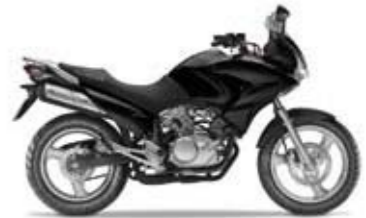
Pearl Concours Black