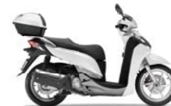
Pearl Cool White