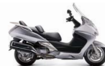
Digital Silver Metallic