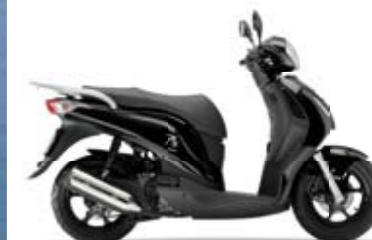
Interstellar Black Metallic