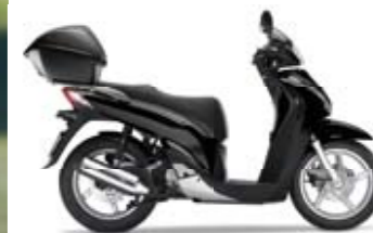
Pearl Nightstar Black