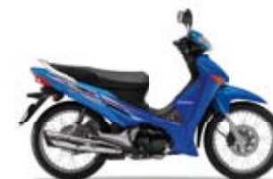
Candy Caribbean Blue Sea / Candy Lighting Blue