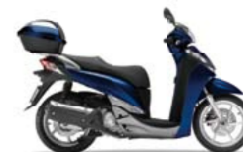
Pearl Pacific Blue